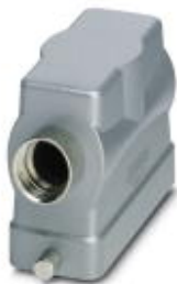
HEAVYCON B16 sleeve housing, for single locking latch, height: 76 mm, with 1 x M32 gland, lateral cable outlet

Please be informed that the data shown in this PDF Document is generated from our Online Catalog. Please find the complete data in the user's documentation. Our General Terms of Use for Downloads are valid ( http://phoenixcontact.com/download )