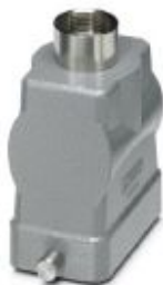
HEAVYCON B16 sleeve housing, for single locking latch, height: 76 mm, with 1 x Pg29 gland, straight cable outlet

Please be informed that the data shown in this PDF Document is generated from our Online Catalog. Please find the complete data in the user's documentation. Our General Terms of Use for Downloads are valid ( http://phoenixcontact.com/download )