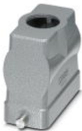
HEAVYCON B16 sleeve housing, for single locking latch, height: 76 mm, with 1 x M25 thread, straight cable outlet

Please be informed that the data shown in this PDF Document is generated from our Online Catalog. Please find the complete data in the user's documentation. Our General Terms of Use for Downloads are valid ( http://phoenixcontact.com/download )