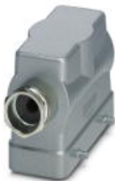
HEAVYCON B16 sleeve housing, for double locking latch, height: 76 mm, with 1 x Pg21 screw connection, lateral cable outlet

Please be informed that the data shown in this PDF Document is generated from our Online Catalog. Please find the complete data in the user's documentation. Our General Terms of Use for Downloads are valid ( http://phoenixcontact.com/download )