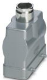
HEAVYCON B16 sleeve housing, for double locking latch, height: 76 mm, with 1 x Pg29 screw connection, straight cable outlet

Please be informed that the data shown in this PDF Document is generated from our Online Catalog. Please find the complete data in the user's documentation. Our General Terms of Use for Downloads are valid ( http://phoenixcontact.com/download )