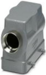
HEAVYCON sleeve housing B16, for double locking latch, height 76 mm, with support 1x M25, lateral conductor exit

Please be informed that the data shown in this PDF Document is generated from our Online Catalog. Please find the complete data in the user's documentation. Our General Terms of Use for Downloads are valid ( http://phoenixcontact.com/download )