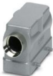
HEAVYCON B16 sleeve housing, for double locking latch, height: 76 mm, with 1 x Pg29 gland, lateral cable outlet

Please be informed that the data shown in this PDF Document is generated from our Online Catalog. Please find the complete data in the user's documentation. Our General Terms of Use for Downloads are valid ( http://phoenixcontact.com/download )