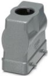
HEAVYCON B16 sleeve housing, for double locking latch, height: 76 mm, with 1 x M25 thread, straight cable outlet

Please be informed that the data shown in this PDF Document is generated from our Online Catalog. Please find the complete data in the user's documentation. Our General Terms of Use for Downloads are valid ( http://phoenixcontact.com/download )