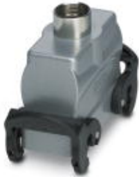
HEAVYCON B16 sleeve housing, with double locking latch, height: 56 mm, with 1 x M25 gland, straight cable outlet

Please be informed that the data shown in this PDF Document is generated from our Online Catalog. Please find the complete data in the user's documentation. Our General Terms of Use for Downloads are valid ( http://phoenixcontact.com/download )