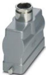
HEAVYCON B24 sleeve housing, for single locking latch, height: 76 mm, with 1 x Pg29 screw connection, straight cable outlet

Please be informed that the data shown in this PDF Document is generated from our Online Catalog. Please find the complete data in the user's documentation. Our General Terms of Use for Downloads are valid ( http://phoenixcontact.com/download )