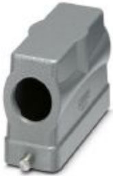
HEAVYCON B24 sleeve housing, for single locking latch, height: 76 mm, with 1 x M40 thread, lateral cable outlet

Please be informed that the data shown in this PDF Document is generated from our Online Catalog. Please find the complete data in the user's documentation. Our General Terms of Use for Downloads are valid ( http://phoenixcontact.com/download )