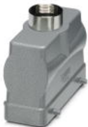
HEAVYCON sleeve housing B24, for double locking latch, height 76 mm, with support 1x M32, straight conductor exit

Please be informed that the data shown in this PDF Document is generated from our Online Catalog. Please find the complete data in the user's documentation. Our General Terms of Use for Downloads are valid ( http://phoenixcontact.com/download )