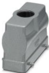
HEAVYCON B24 sleeve housing, for double locking latch, height: 76 mm, with 1 x M25 thread, straight cable outlet

Please be informed that the data shown in this PDF Document is generated from our Online Catalog. Please find the complete data in the user's documentation. Our General Terms of Use for Downloads are valid ( http://phoenixcontact.com/download )