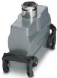
HEAVYCON B24 sleeve housing, with double locking latch, height: 72 mm, with 1 x Pg21 screw connection, straight cable outlet

Please be informed that the data shown in this PDF Document is generated from our Online Catalog. Please find the complete data in the user's documentation. Our General Terms of Use for Downloads are valid ( http://phoenixcontact.com/download )