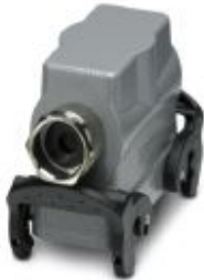
HEAVYCON B24 sleeve housing, with double locking latch, height: 72 mm, with 1 x Pg29 screw connection, lateral cable outlet

Please be informed that the data shown in this PDF Document is generated from our Online Catalog. Please find the complete data in the user's documentation. Our General Terms of Use for Downloads are valid ( http://phoenixcontact.com/download )