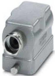
Sleeve housing, for single locking latch, height: 56 mm, with screw connection, 1 x M20, lateral cable outlet

Please be informed that the data shown in this PDF Document is generated from our Online Catalog. Please find the complete data in the user's documentation. Our General Terms of Use for Downloads are valid ( http://phoenixcontact.com/download )