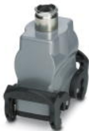
HEAVYCON B10 coupling housing, with double locking latch, height: 77.5 mm, with 1 x Pg16 screw connection, straight cable outlet

Please be informed that the data shown in this PDF Document is generated from our Online Catalog. Please find the complete data in the user's documentation. Our General Terms of Use for Downloads are valid ( http://phoenixcontact.com/download )