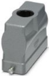
HEAVYCON B24 sleeve housing, for single locking latch, height: 65 mm, with 1 x M32 thread, straight cable outlet

Please be informed that the data shown in this PDF Document is generated from our Online Catalog. Please find the complete data in the user's documentation. Our General Terms of Use for Downloads are valid ( http://phoenixcontact.com/download )