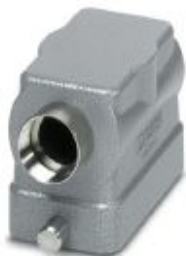
HEAVYCON B6 sleeve housing, for single locking latch, height: 56 mm, with 1 x Pg16 gland, lateral cable outlet

Please be informed that the data shown in this PDF Document is generated from our Online Catalog. Please find the complete data in the user's documentation. Our General Terms of Use for Downloads are valid ( http://phoenixcontact.com/download )