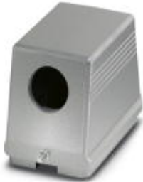
HEAVYCON sleeve housing B48, for single locking latch, height 96 mm, with thread 1x M50, lateral conductor exit

Please be informed that the data shown in this PDF Document is generated from our Online Catalog. Please find the complete data in the user's documentation. Our General Terms of Use for Downloads are valid ( http://phoenixcontact.com/download )