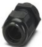
Cable gland, cable gland material: PA, external cable diameter 6 mm ... 12 mm, shielding: no, connecting thread: M20 x 1.5, color: jet black RAL 9005

Cable gland - G-INS-M20-S68N-PNES-BK - 1411133