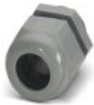
Cable gland, cable gland material: PA, external cable diameter 6 mm ... 12 mm, shielding: no, connecting thread: M20 x 1.5, color: silver-gray RAL 7001

Cable gland - G-INS-M20-S68N-PNES-GY - 1411125