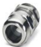
Cable gland, cable gland material: Nickel-plated brass, external cable diameter 6 mm ... 12 mm, shielding: no, connecting thread: M20 x 1.5, color: silver, with O-ring

Cable gland - G-INS-M20-S68N-NNES-S - 1411163