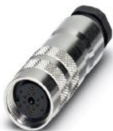
M16 socket, 14-pos., with solder connection, freely configurable, straight, for a 6.0 mm conductor diameter ... 8.0 mm

Please be informed that the data shown in this PDF Document is generated from our Online Catalog. Please find the complete data in the user's documentation. Our General Terms of Use for Downloads are valid ( http://phoenixcontact.com/download )