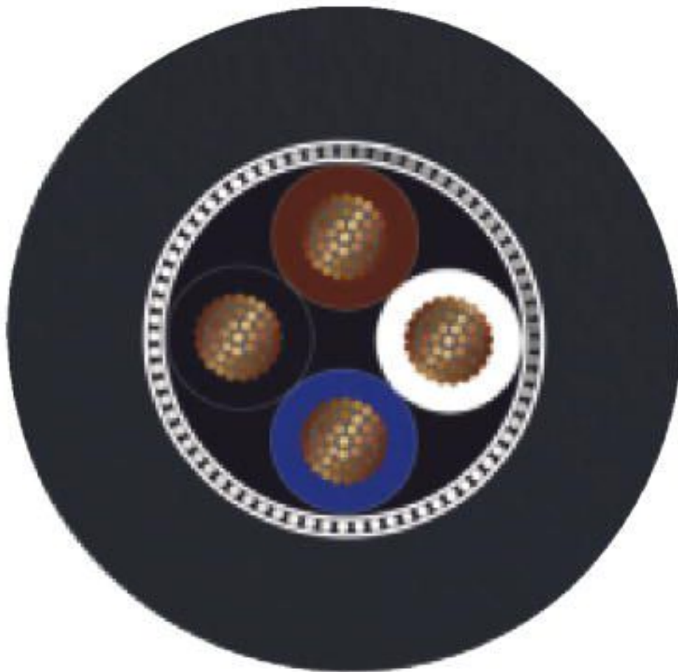
Cable cross section