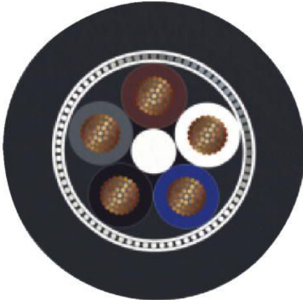
Cable cross section