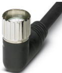
Socket M23, 19-pos., angled, shielded, with shielded, connected master cable, length: 10 m

Please be informed that the data shown in this PDF Document is generated from our Online Catalog. Please find the complete data in the user's documentation. Our General Terms of Use for Downloads are valid ( http://phoenixcontact.com/download )