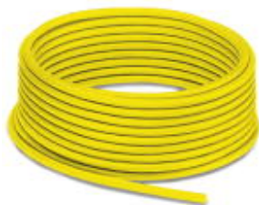
Cable ring, PVC yellow, 4-pos., conductor colors: brown/white/blue/black, cable length: 100 m

Please be informed that the data shown in this PDF Document is generated from our Online Catalog. Please find the complete data in the user's documentation. Our General Terms of Use for Downloads are valid ( http://phoenixcontact.com/download )