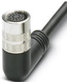
Master cable, 14-position, PUR/PVC, deep black RAL 9005, free cable end, on Socket angled M16, cable length: 15 m

Please be informed that the data shown in this PDF Document is generated from our Online Catalog. Please find the complete data in the user's documentation. Our General Terms of Use for Downloads are valid ( http://phoenixcontact.com/download )