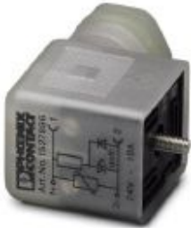
Valve connectors, 3-position, Valve connector BI (11 mm), with 1 LED, connected with Varistor, Screw connection, cable gland Pg9, external cable diameter 6 mm ... 8 mm

Please be informed that the data shown in this PDF Document is generated from our Online Catalog. Please find the complete data in the user's documentation. Our General Terms of Use for Downloads are valid ( http://phoenixcontact.com/download )