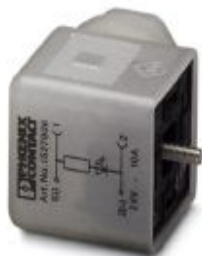
Valve connectors, Universal, 3-position, Valve connector A, with 1 LED, Screw connection, cable gland Pg9, external cable diameter 6 mm ... 8 mm

Please be informed that the data shown in this PDF Document is generated from our Online Catalog. Please find the complete data in the user's documentation. Our General Terms of Use for Downloads are valid ( http://phoenixcontact.com/download )