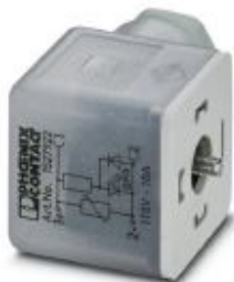
Valve connectors, Universal, 3-position, Valve connector A, with 1 LED, connected with Varistor, Screw connection, cable gland Pg9, external cable diameter 6 mm ... 8 mm

Please be informed that the data shown in this PDF Document is generated from our Online Catalog. Please find the complete data in the user's documentation. Our General Terms of Use for Downloads are valid ( http://phoenixcontact.com/download )