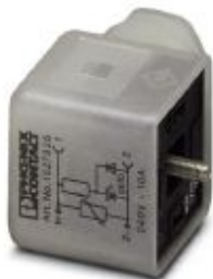
Valve connectors, Universal, 3-position, Valve connector A, with 1 LED, connected with Varistor, Screw connection, cable gland Pg9, external cable diameter 6 mm ... 8 mm

Please be informed that the data shown in this PDF Document is generated from our Online Catalog. Please find the complete data in the user's documentation. Our General Terms of Use for Downloads are valid ( http://phoenixcontact.com/download )