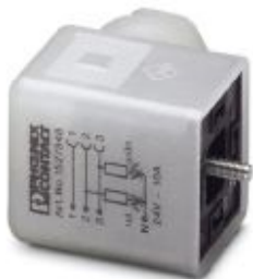
Valve connectors, Universal, 5-position, Valve connector AD (pressure switch), with 2 LEDs, Screw connection, cable gland Pg9, external cable diameter 6 mm ... 8 mm

Please be informed that the data shown in this PDF Document is generated from our Online Catalog. Please find the complete data in the user's documentation. Our General Terms of Use for Downloads are valid ( http://phoenixcontact.com/download )