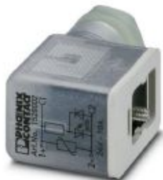
Valve connectors, 3-position, Valve connector B (10 mm), with 1 LED, connected with Varistor, Screw connection, cable gland Pg9, external cable diameter 6 mm ... 8 mm

Please be informed that the data shown in this PDF Document is generated from our Online Catalog. Please find the complete data in the user's documentation. Our General Terms of Use for Downloads are valid ( http://phoenixcontact.com/download )