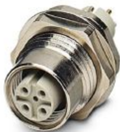
Sensor/Actuator flush-type socket, 4-pos., M12, A-coded, rear/screw mounting with Pg9 thread, with straight solder connection

Please be informed that the data shown in this PDF Document is generated from our Online Catalog. Please find the complete data in the user's documentation. Our General Terms of Use for Downloads are valid ( http://phoenixcontact.com/download )