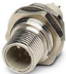
Sensor/Actuator flush-type plug, 5-pos., M12, A-coded, rear/screw mounting with Pg9 thread, with straight solder connection

Please be informed that the data shown in this PDF Document is generated from our Online Catalog. Please find the complete data in the user's documentation. Our General Terms of Use for Downloads are valid ( http://phoenixcontact.com/download )