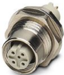
Sensor/Actuator flush-type socket, 5-pos., M12, B-coded, rear/screw mounting with Pg9 thread, with straight solder connection

Please be informed that the data shown in this PDF Document is generated from our Online Catalog. Please find the complete data in the user's documentation. Our General Terms of Use for Downloads are valid ( http://phoenixcontact.com/download )