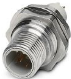
Sensor/Actuator flush-type plug, 5-pos., M12, B-coded, rear/screw mounting with Pg9 thread, with straight solder connection

Please be informed that the data shown in this PDF Document is generated from our Online Catalog. Please find the complete data in the user's documentation. Our General Terms of Use for Downloads are valid ( http://phoenixcontact.com/download )