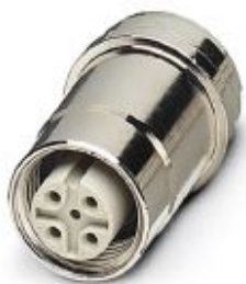
Sensor/actuator flush-type socket, 4-pos., M12, A-coded, front/press-in mounting, with straight solder connection

Please be informed that the data shown in this PDF Document is generated from our Online Catalog. Please find the complete data in the user's documentation. Our General Terms of Use for Downloads are valid ( http://phoenixcontact.com/download )