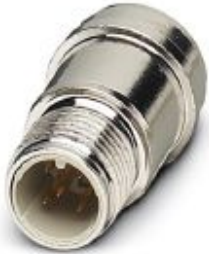
Sensor/actuator flush-type plug, 4-pos., M12, A-coded, front/press-in mounting, with straight solder connection

Please be informed that the data shown in this PDF Document is generated from our Online Catalog. Please find the complete data in the user's documentation. Our General Terms of Use for Downloads are valid ( http://phoenixcontact.com/download )