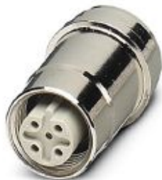
Sensor/actuator flush-type socket, 5-pos., M12, B-coded, front/press-in mounting, with straight solder connection

Please be informed that the data shown in this PDF Document is generated from our Online Catalog. Please find the complete data in the user's documentation. Our General Terms of Use for Downloads are valid ( http://phoenixcontact.com/download )