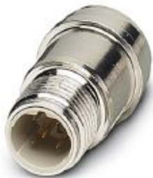
Sensor/actuator flush-type plug, 5-pos., M12, B-coded, front/press-in mounting, with straight solder connection

Please be informed that the data shown in this PDF Document is generated from our Online Catalog. Please find the complete data in the user's documentation. Our General Terms of Use for Downloads are valid ( http://phoenixcontact.com/download )