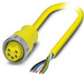
Sensor/actuator cable, 5-position, PVC, yellow, free cable end, on Socket straight 7/8"-16UNF, A-coded, cable length: 4 m

Please be informed that the data shown in this PDF Document is generated from our Online Catalog. Please find the complete data in the user's documentation. Our General Terms of Use for Downloads are valid ( http://phoenixcontact.com/download )