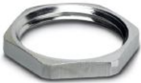
Flat nut with Pg13.5 thread

Please be informed that the data shown in this PDF Document is generated from our Online Catalog. Please find the complete data in the user's documentation. Our General Terms of Use for Downloads are valid ( http://phoenixcontact.com/download )