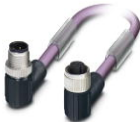
Sensor/actuator cable, 5-position, PUR, violet RAL 4001, Plug angled M12, on Socket angled M12, cable length: 5 m

Please be informed that the data shown in this PDF Document is generated from our Online Catalog. Please find the complete data in the user's documentation. Our General Terms of Use for Downloads are valid ( http://phoenixcontact.com/download )