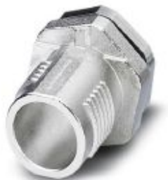
M12 SPEEDCON housing screw connection for M12 male inserts, with O-ring, for all SPEEDCON-capable THR and wave soldering contact carriers

Please be informed that the data shown in this PDF Document is generated from our Online Catalog. Please find the complete data in the user's documentation. Our General Terms of Use for Downloads are valid ( http://phoenixcontact.com/download )