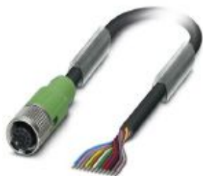
Sensor/actuator cable, 12-position, PVC, black RAL 9005, free cable end, on Socket straight M12 SPEEDCON, coding: A, cable length: 1.5 m

Please be informed that the data shown in this PDF Document is generated from our Online Catalog. Please find the complete data in the user's documentation. Our General Terms of Use for Downloads are valid ( http://phoenixcontact.com/download )