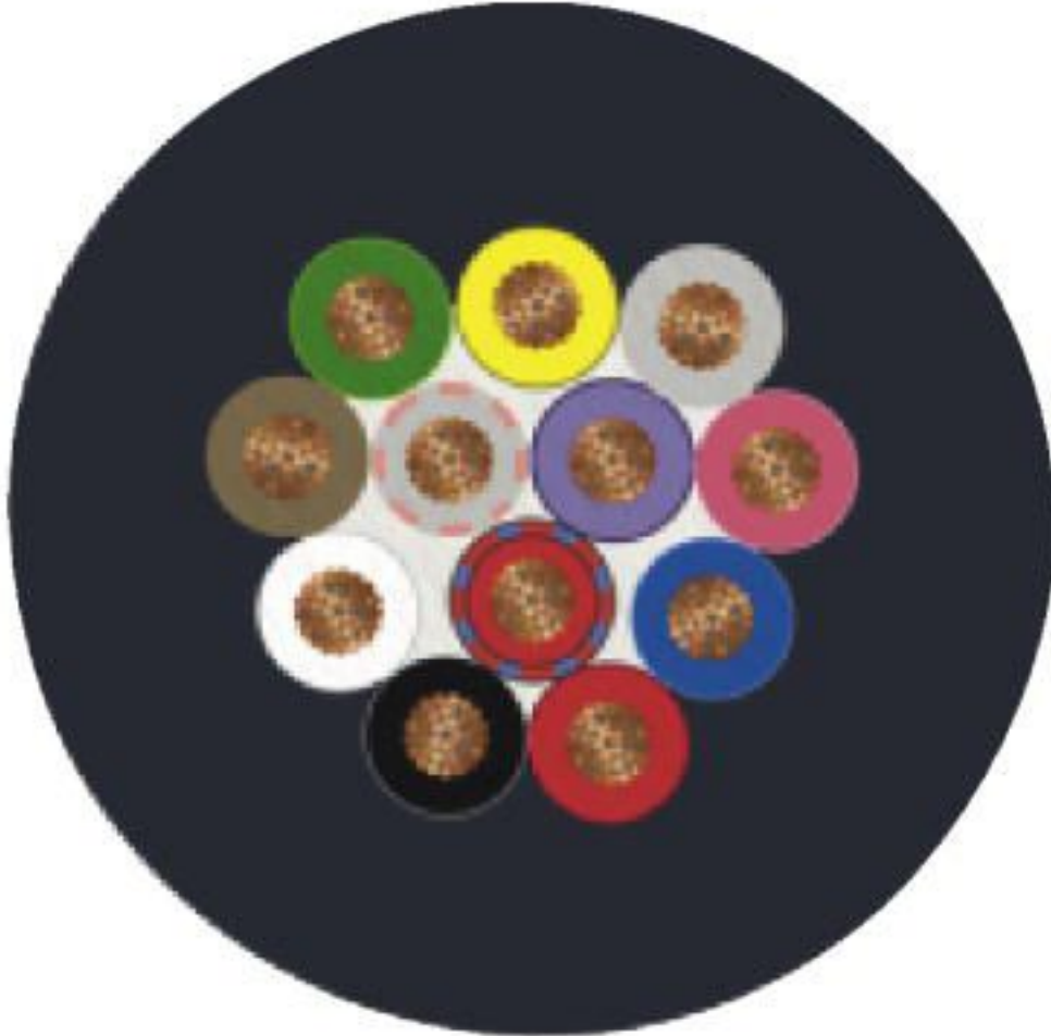
Cable cross section