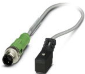
Sensor/actuator cable, 2-pos, PUR/PVC gray, straight M12 SPEEDCON plug on valve connector type MSZC, with one LED, cable length: 0.25 m

Please be informed that the data shown in this PDF Document is generated from our Online Catalog. Please find the complete data in the user's documentation. Our General Terms of Use for Downloads are valid ( http://phoenixcontact.com/download )