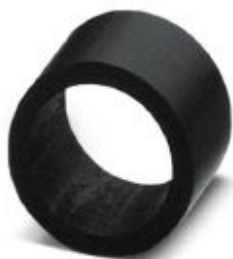
Insert seal for QUICKON T-distributor, for IP65 sealing of thin power conductors (11.5 mm ... 14 mm)

Please be informed that the data shown in this PDF Document is generated from our Online Catalog. Please find the complete data in the user's documentation. Our General Terms of Use for Downloads are valid ( http://phoenixcontact.com/download )