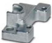
Panel mounting flange for HEAVYCON-ADVANCE TMS housing with screw locking