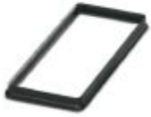
Profile gasket for sleeve housing type B16.....EEE

Profile gasket - HC-B 16-TMS-EEE-PR-DI - 1409817