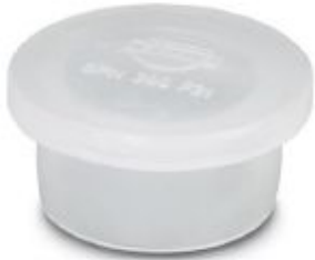
Protective cap made of transparent plastic for QPD QUICKON connection 4x 2.5 mm 2 , IP50.

Please be informed that the data shown in this PDF Document is generated from our Online Catalog. Please find the complete data in the user's documentation. Our General Terms of Use for Downloads are valid ( http://phoenixcontact.com/download )